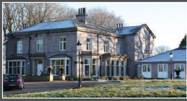
TTP Chorley (Withnell House) 🔺