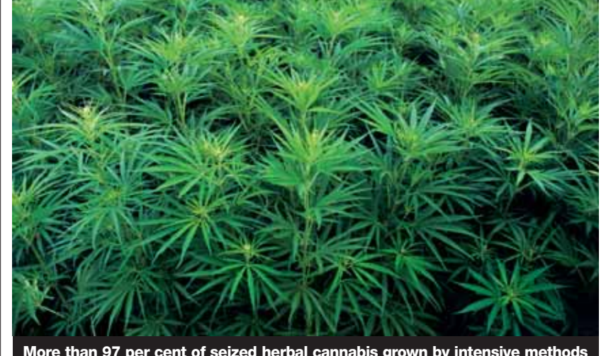
More than 97 per cent of seized herbal cannabis grown by intensive methods

'It will also help health boards and their partners increase their funding to voluntary organisations,' he said. 'The extra cash will help get those seeking help the treatment they need and quickly.'